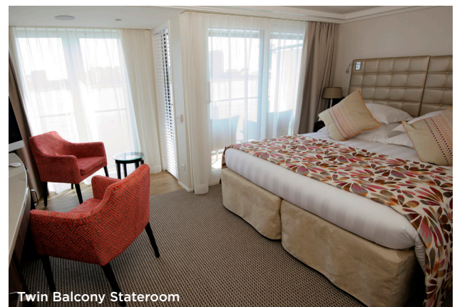
Twin Balcony Stateroom