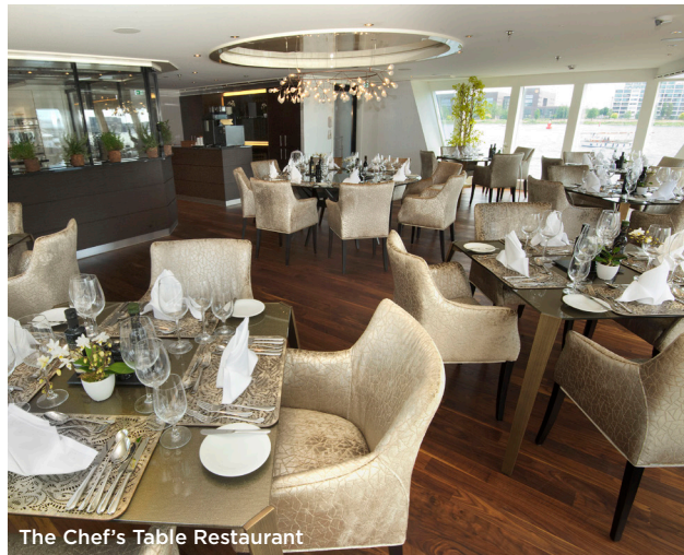
The Chef's Table Restaurant

AmaWaterways' twin-balcony ships represent some of the newest vessels in our fleet. Heated pools with a swim-up bar provide a tranquil environment for viewing stunning mountains and spired skylines. Plus, spacious staterooms afford guests comfort and privacy to rejuvenate while still experiencing the magnificent scenery.